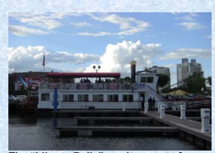
The "Liberty Belle" awaits guests for the graduation banquet cruise on the Delaware River.