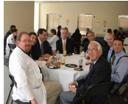
A beautiful spring day allowed some participants to enjoy lunch on the patio of the Hamilton building