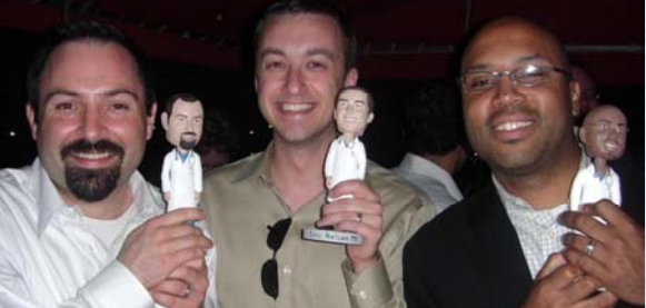
The Bobble heads were prefect likenesses.