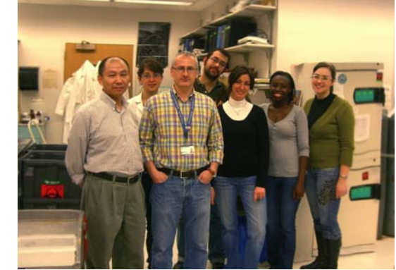
Urology Research Team

Proepithelin has previously been shown to play a role in the formation of bladder cancer, and it's over expression is related to an aggressive form of breast cancer according