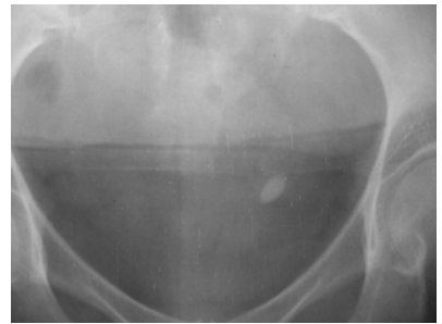
Distal Left Ureteral stone