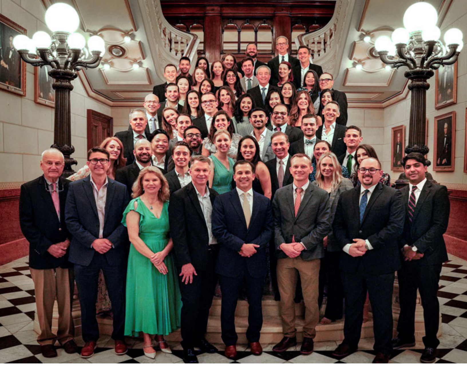
Jefferson Otolaryngology—Head & Neck Surgery 2022 Graduation Photo